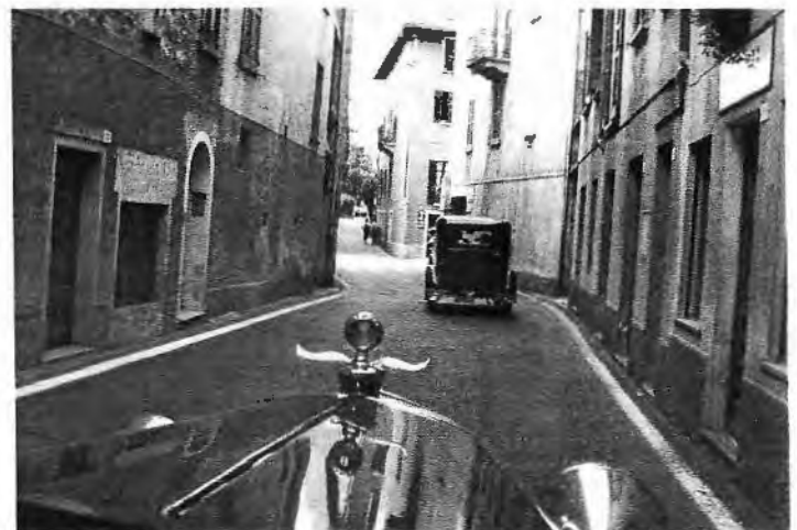
Most consistent scenery was the back of another Model A ...unless you're lost!