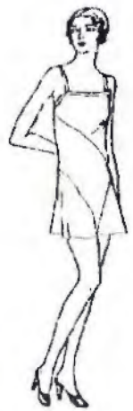
1920s-006 Sizes S-XXL $10.00